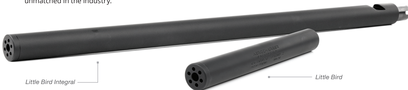
Little Bird Integral

Originating from the need to easily adjust baffle spacing for product testing, the Little Bird's patent pending design has proven very effective. The threaded interior allows baffles to be adjusted for tuning and self-cleaning; a unique feature unmatched in the industry.